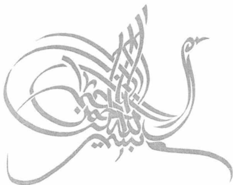
The Arabic word, Bismillah , 'In the name of God', created in the shape of an ostrich by Sudanese artist Hassan Musa. Courtesy of Grandir Editions