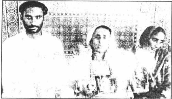
جوهڙ جمالي: زمين جي قبضي خلاف رهواسي ڏانهن رهيا آهن