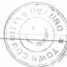
TOWN OFFICER, TOWN COMMITTEE UBAURO.