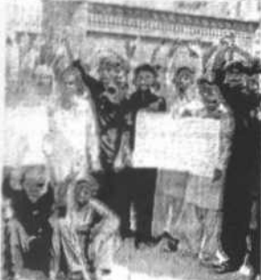
سکر: ڪشمور واپس پيا برادري جا مائهو روڻ

ب سامونڊي تائين نئون سجاوڻ ۽ پيڻي سنه وڌندو.