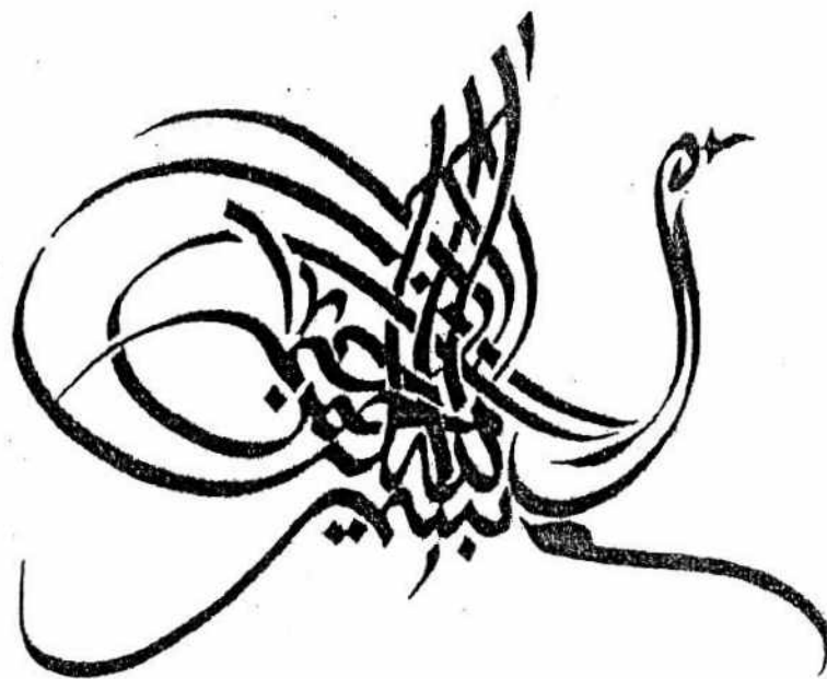
The Arabic word, Bismillah , 'In the name of God', created in the shape of an ostrich by Sudanese artist Hassan Musa. Courtesy of Grandir Editions.