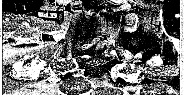
لاہور میں دکاندار گاؤں کو توجہ کرنے کے لیے سڑک کنارے سیٹ اپ پر سٹاک ہاٹارہ کی سب سے رکھ رہے ہیں

تین کی کمپنیاں پاکستان پر خصوصی توجہ مرکوز کر رہی ہیں، کارکنوں موراثہ کی لاہور چیئرمین میں گفتگو لاہور (کامرس رپورٹرز) تین کے سٹاک ہاٹارہ اور سپاولی سیر کے حوالے سے پاکستان تجارت و سرمایہ کاری کے ماحولوں اور دیگر سے بالابال ملک ہے، عالمی سطح پر اس کی سٹاک سازی کر سکتے ہیں۔ انہوں نے کہا کہ پاکستان سیاحت کے شعبے میں تین کے تجربات سے استفادہ کر سکتا ہے کیونکہ تین نے اس شعبے میں بہت ترقی کی ہے۔ لاہور چیئرمین کے سٹاک ہاٹارہ صدر ایس جیڈ نے کہا کہ پاکستان اور تین کے درمیان ہمیشہ بہترین دوستانہ تعلقات رہے ہیں جبکہ تین پاکستان کے بڑے تجارتی شراکت داروں میں سے ایک ہے۔ انہوں نے کہا یہ بڑی خوش آئند بات ہے کہ دونوں ممالک کے درمیان تجارت کا حجم بتدریج بڑھ رہا ہے اور سال 2015ء میں یہ بڑھ کر 937 ملین ڈالر تک پہنچ گئی۔ انہوں نے کہا کہ دونوں ممالک کے تاجروں کے درمیان فاریما سٹیٹنگ، الیکٹریکل اینڈ اینٹرنل، فوڈ اینڈ ڈریسٹریبلز کی مصنوعات، انگریزی مصنوعات، معدنیات اور توانائی کی پیداوار کے شعبوں میں مشترکہ منصوبہ سازی کے مواقع نمایاں رہ سکتے ہیں۔