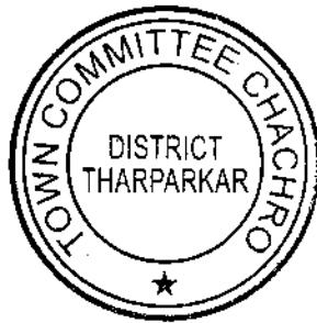
TOWN OFFICER Town Committee Chachro District Tharparkar.

The next date of issuance and opening of unresponded works shall be 02/04/2014 with same terms & conditions.