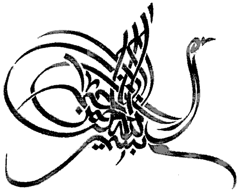
The Arabic word, Bismillah , 'In the name of God', created in the shape of an ostrich by Sudanese artist Hassan Musa.